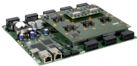
Carrier module with expander module and 2× I/O module