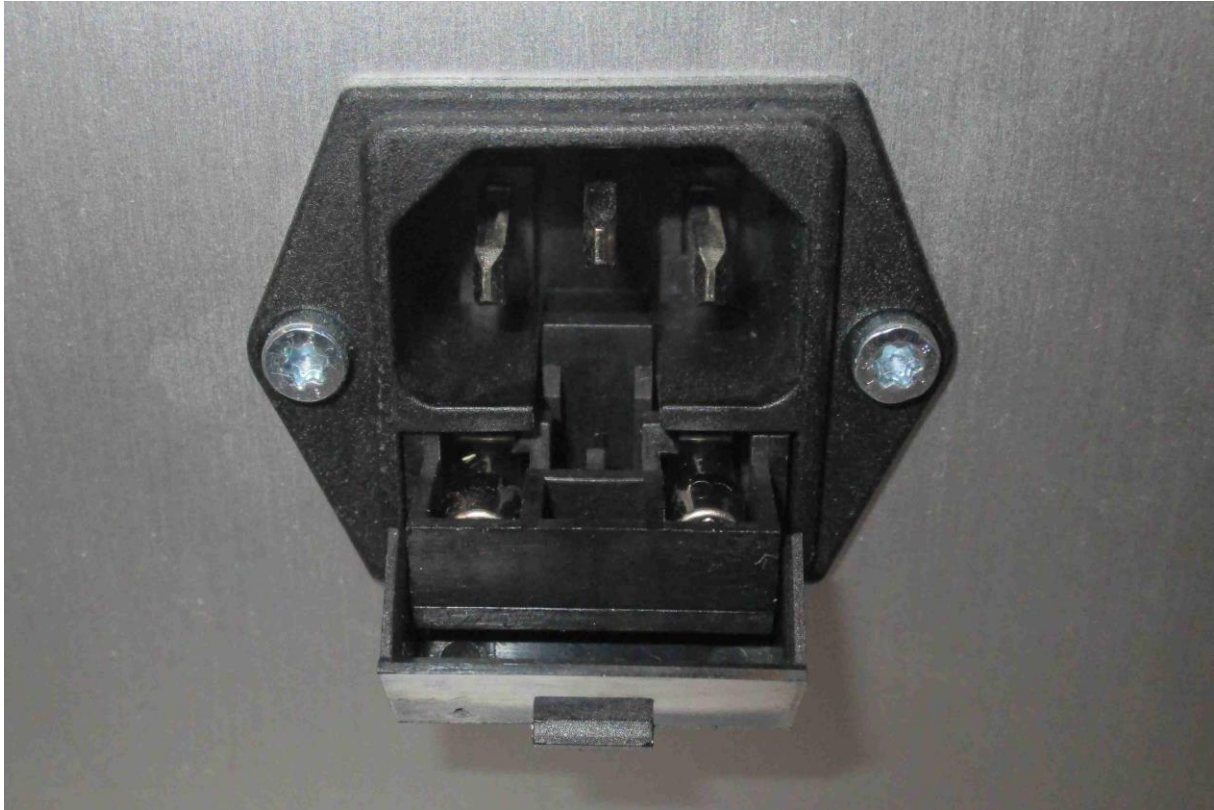
Fig. 4: Location of Fuses

To change the fuses, you have to open the fuse cover and to pull out the drawer. Refer to the picture below.