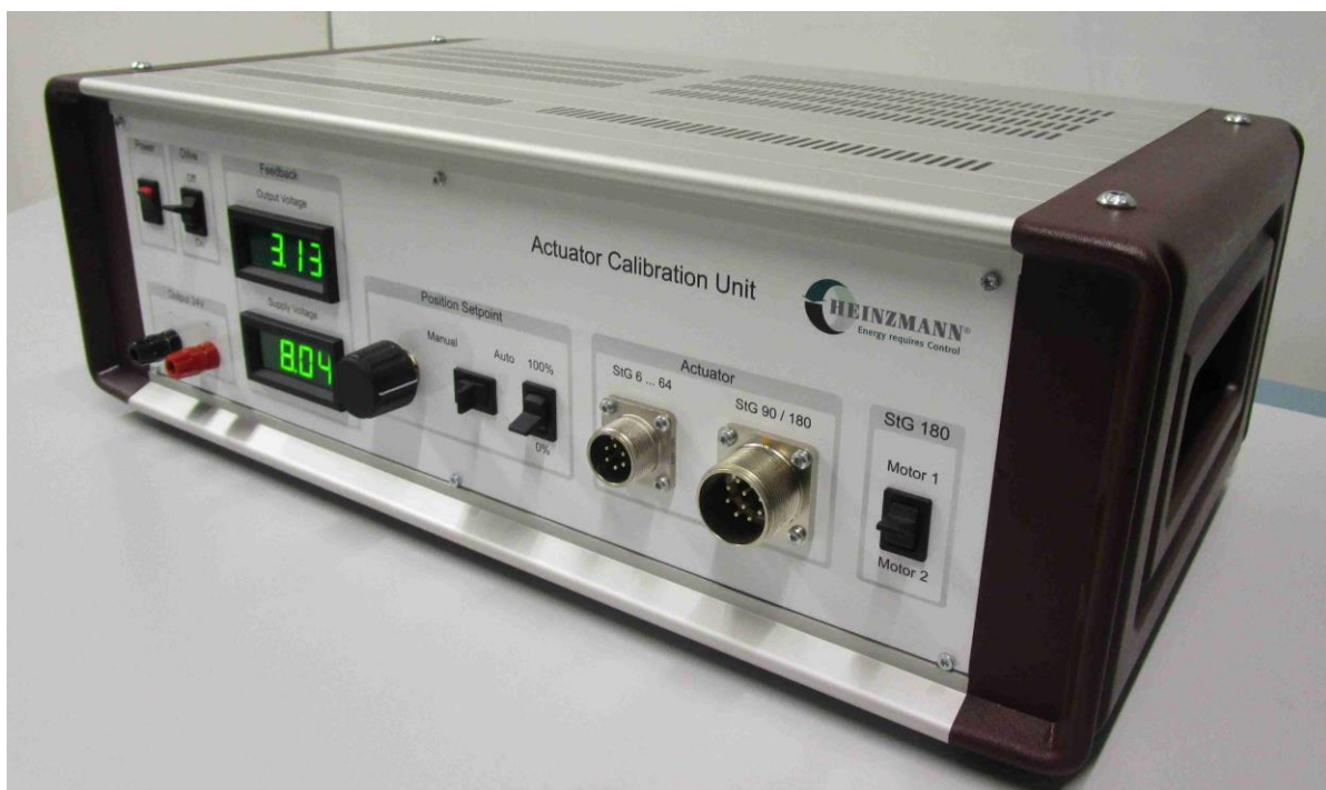
Fig. 1: Photo of Actuator Calibration Unit

The following picture shows the Actuator Calibration Unit.