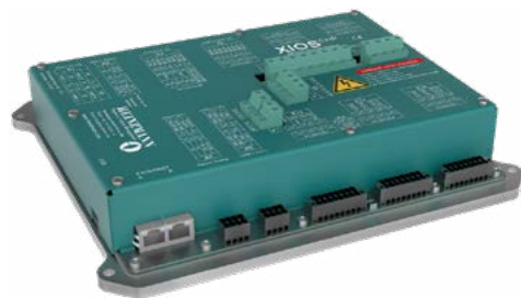
XIOS UC + MD2 for XIOS GenSet or XIOS CHP applications