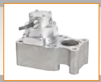
MEGASOL 200 II/250 II/400 II/425 II