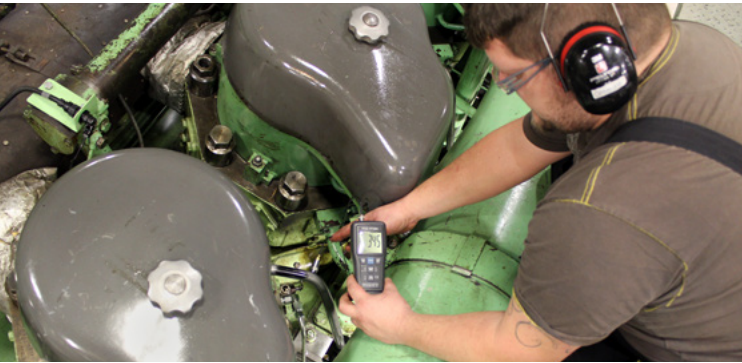
Vibration measurements show a smoother engine run after the conversion

Due to improved combustion conditions with HEINZMANN Common Rail Retrofit, engine efficiency is increased in the entire operating range resulting in significant fuel savings. Particulate emissions and deposits in the exhaust system are reduced. A smooth combustion profile combined with cylinder balancing leads to low component load, wear and vibration with a positive effect on lifetime.