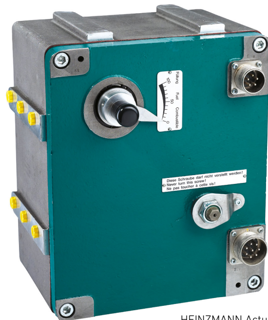
HEINZMANN Actuator StG 90