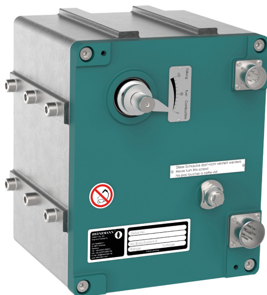
HEINZMANN Actuator StG 180

From HEINZMANN's experience with StG 90 and StG 180 applications, we recommend checking the actuators as described below annually or at least after 20.000 running hours, and they should be overhauled by a HEINZMANN approved work shop after 40.000 running hours.